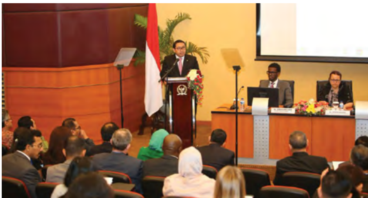
Regional Workshop on Parliaments and SDGs, 30 to 31 August 2016, Jakarta, Indonesia.

It is important for parliaments and parliamentarians to know that they are not alone in their efforts to monitor SDG implementation to achieve key development objectives. Many regional and global organizations work to promote the achievement of one or more of the SDGs. Some of these groups may already be engaged with your parliament; if not, they can be engaged to support the work of parliamentarians and parliament to build capacity and support your efforts to be a full and active partner in the implementation of the SDGs in your country.