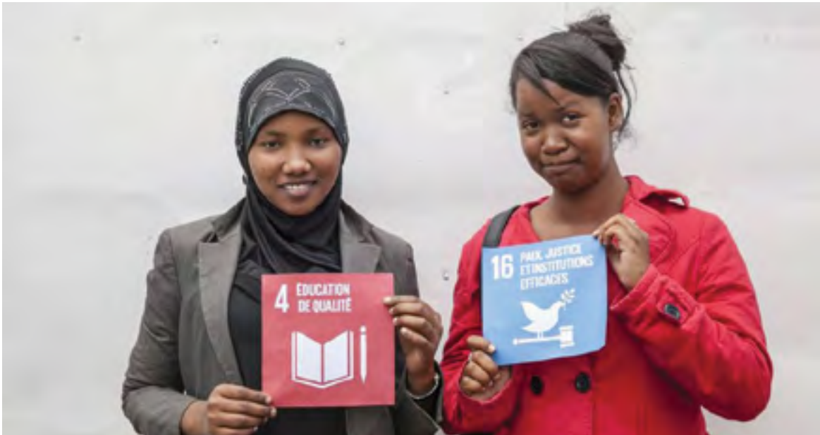
UNDP Madagascar Youth raise Global Goals at Social Good Summit in Madagascar on September 2015