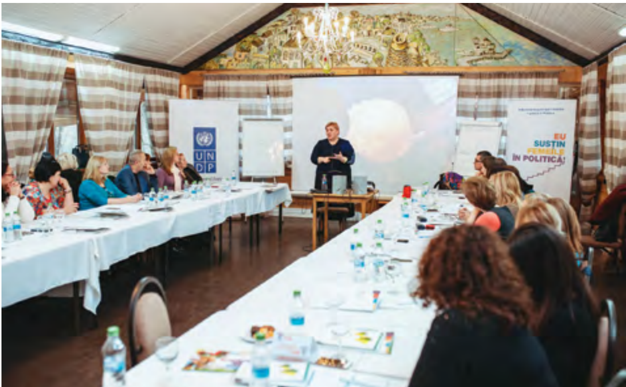
UNDP Moldova Parliament Secretariat pledges to promote a gender-responsive human resources management on 23rd November 2016.

To get from here to there, as mentioned earlier, all parliaments will need to build new capacities. Even if your parliament is actively engaging public and seeking their feedback through the work of members and committees; even if your parliament has the capacity to conduct in-depth research and has in place systems that allow people's voices to be actively expressed through parliamentarians; there will still be a need to reflect on how your systems must be retooled to ensure they will advance the 17 SDGs.