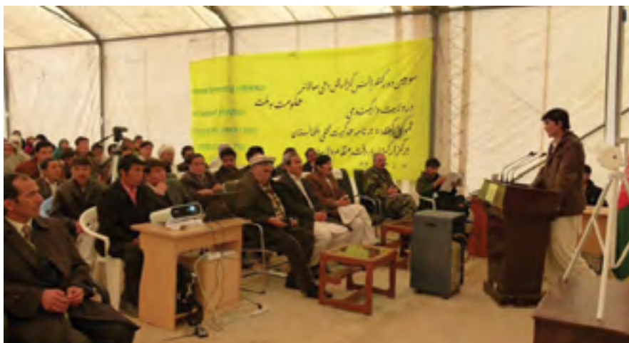
UNAMA Third Dai Kundi Annual Reporting Conference in Afghanistan on January 2012.

Public consultations: As noted in Section VI above, parliamentary committees should be engaging civil society and the public as they consider draft laws and conduct inquiries. Such consultations can range from the informal (such as public forums and reporting sessions) to the more formal (e.g., public hearings); and from the technical (e.g., surveys) to the simple (e.g., requests for submissions via SMS). Consultation can also come in the form of virtual engagement, including online feedback, surveys and social media.