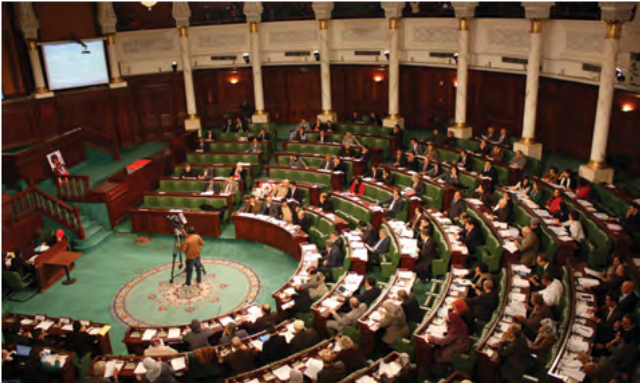
UNDP Tunisia Debates of the Tunisian Constitution, 20th January 2014.

Ideally, proposed draft laws dealing with development-related issues will explicitly identify whether and how they support Agenda 2030 and specific SDGs and their targets. This could be included in the explanatory memorandum to the draft law and in the speech introducing the draft law. Currently, however, this is not common practice. To address this, parliaments themselves may wish to commission an SDG Impact Analysis from their own parliamentary secretariats to identify how the proposed draft law impacts on SDG achievement. Alternatively, the rules of procedure can be amended to require the sponsor of the law to produce such an analysis when the draft law is introduced. Some countries already undertake socio-economic, environmental, and gender impact assessments of draft laws. Lessons learned indicate that such a process can be systematized through the adoption of a simple checklist, which can then be applied by the parliamentary secretariat to each draft law produced for consideration. Parliamentarians can then use this information to identify areas for amendment.