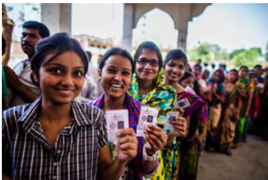
UNDP India India elections 2014.

tasking an existing committee to undertake a specific inquiry into an issue. If there is no committee with subject matter jurisdiction, or when an inquiry may require more dedicated resources, a parliament may also choose to establish an ad hoc or special committee with a specific, singular mandate to undertake an inquiry and then disband upon completion of its work.