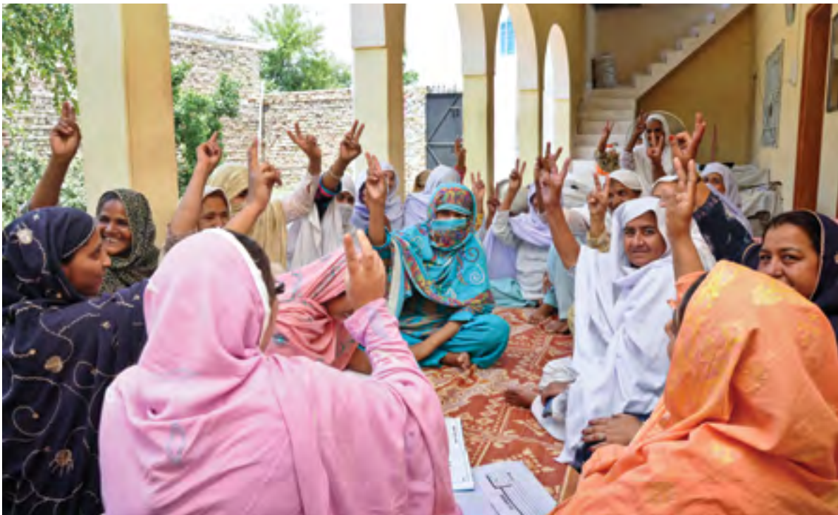
UNDP Pakistan Meeting of female community organization "Shamatanzeem" village "Padhana", and union council "Dheenda" of district Haripur. Discussing general issues.

Below are some ways that a parliament can take specific action to ensure SDG implementation is done in coordination with sub-national and local governments and with the input of people throughout the country.